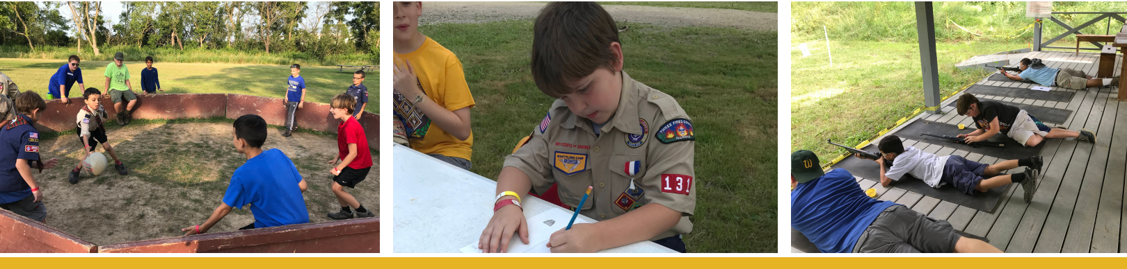
Three Fires Council Boy Scouts of America

Register at: www.ThreeFiresCouncil.org 630-584-9250